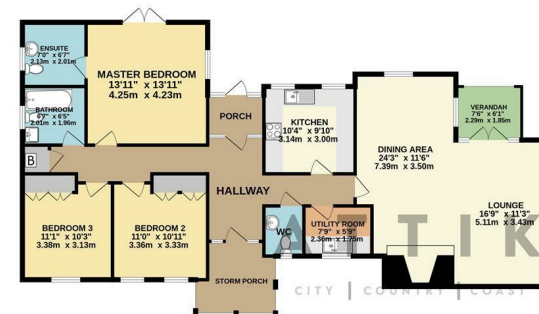
GROUND FLOOR 1849 sq.ft. (171.8 sq.m.) approx.

Contact 01986 899532 enquiries@attikccc.co.uk www.attikccc.co.uk